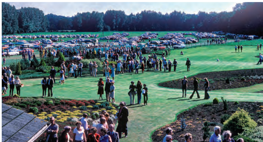
The half planted Foggy Bottom Garden on our second Open Weekend in 1977.

A bit of nostalgia – we want to recreate a bit of the excitement of our open weekends, which ran from 1976-1986, when cars parked in the meadow next to Foggy Bottom where we set up a plant sales area.